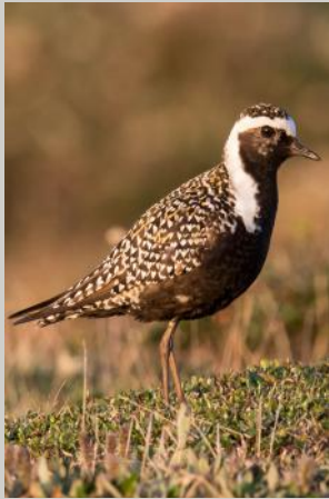
American Golden Plover